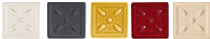
Bianco Antico Ardesia Giallo Acceso Rosso Lava Sahara

(Ardesia, Giallo Acceso, Rosso Lava & Sahara by order only)