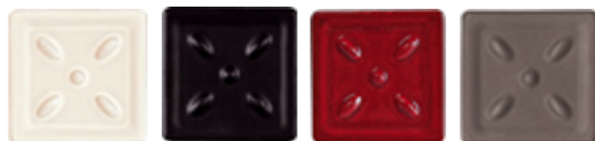
Bianco Nero Opaco Rosso Lava Terra Cotta

(Nero Opaco, Rosso Lava & Terra Cotta by order only)